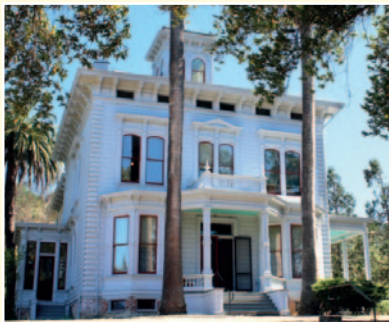
Muir's home in Martinez, now a National Historic Site

Returning south in 1866, he found work in a factory in Indianapolis, where a serious accident to his eye