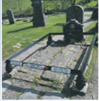
Rob Roy's grave, Balquhiddy: its legend asserts the surname

The legend on his gravestone 'MacGregor despite them' is a defiant response to proscription – the Hanoverian Government's attempt to destroy the clan by forbidding any use of the surname MacGregor. Proscription prevented clansmen from entering into legal contracts, as happened on several occasions. The most recent prohibition was lifted in 1775. After the clan took to the hills, they became known as Clann a' Ched (the 'Children of the Mist'). The memory of the old MacGregors lives on to this day.