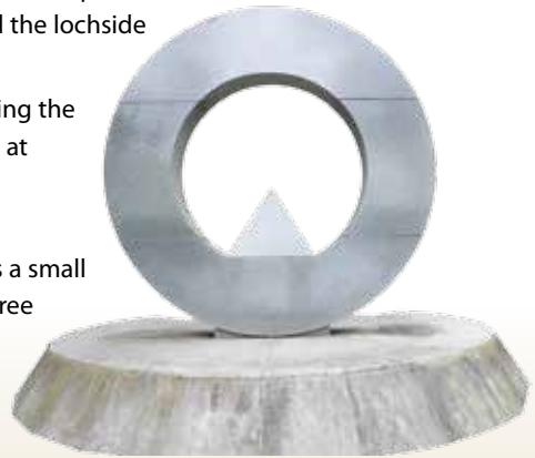
Memorial Park sculpture, Rowardennan