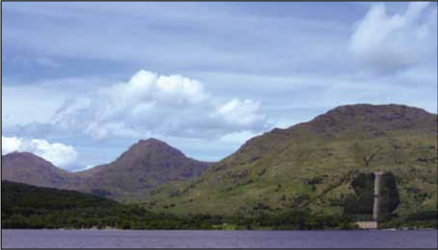
Opposite Inversnaid, the pipes of Sloy power station