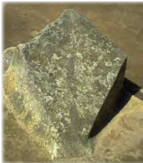
Pointer stone at Machu Picchu, aligned with the Southern Cross

Superb stonework in the wall of a former Inca palace, Cusco