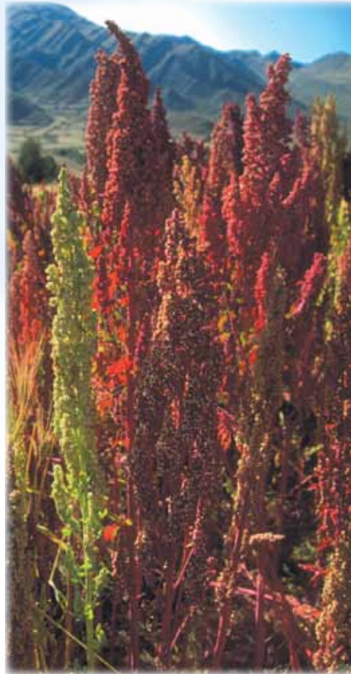
Red quinoa has nutritious, gluten-free seeds; cultivated since 3000 BC, it was held sacred by the Incas

The Inca Atahualpa was told of the Spanish arrival by his chasquis . At the time, he was near Cajamarca with an army of thousands of fit, trained soldiers. Surprisingly, despite being told about the Spaniards raping and stealing, he agreed to meet them in the