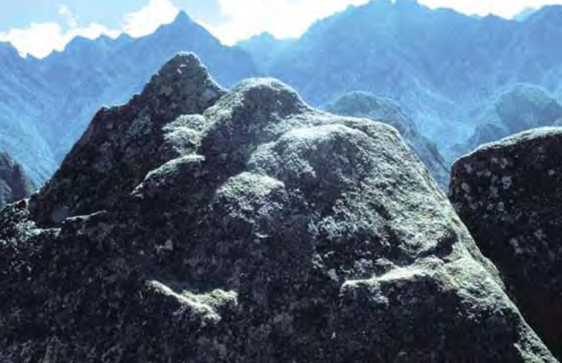
Image stones representing the mountains Yanantin and Putucusi

Inca architecture shows an almost religious commitment to suiting the design and choice of materials to the site. Time and again, you will see an interesting rock preserved in situ and skilfully worked into the structure. Inca stonemasons often expertly shaped huge rocks so as to echo and celebrate the silhouettes of sacred mountains. These are called 'image stones'.