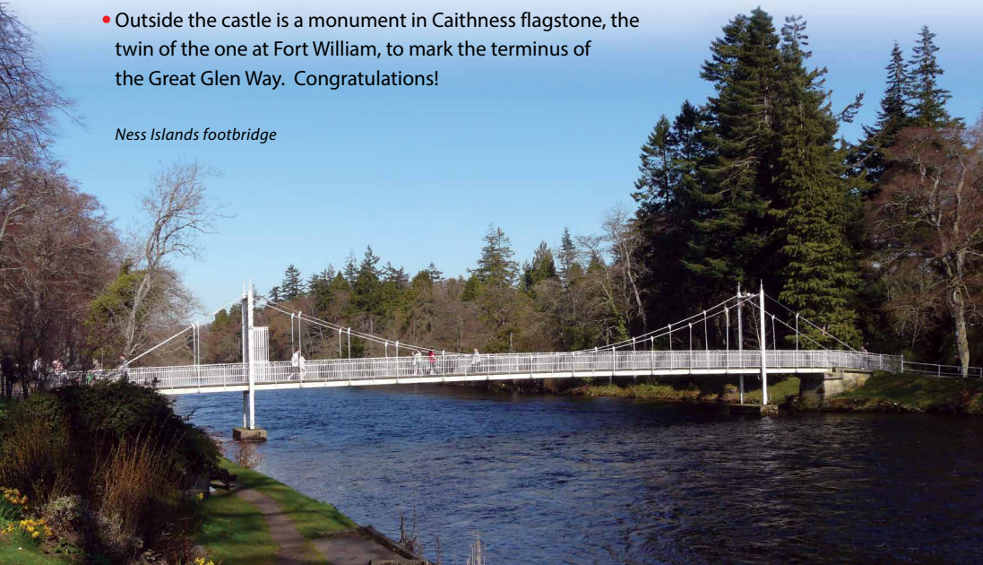
Ness Islands footbridge