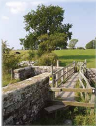
West over Sourmilk Bridge

• Turn right along the road for 100 m to a gate on the left. Cross fields to return to the river. Follow signs to cross small tributaries by a series of gated footbridges, taking care on the steep river bank.