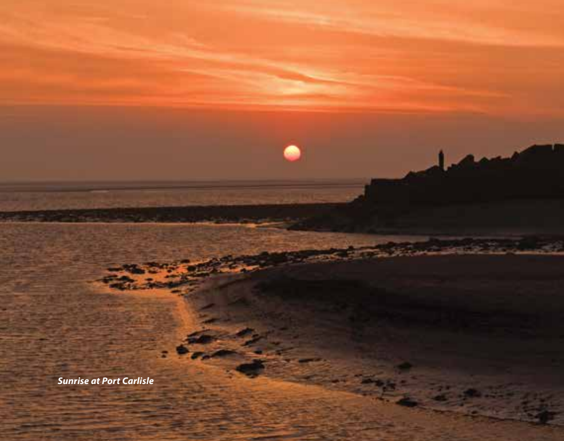
Sunrise at Port Carlisle