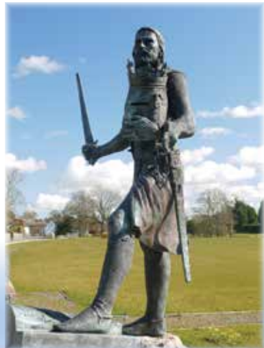
Statue of King Edward at Burgh by Sands

Edward was waiting to cross the Solway while leading a force against Robert the Bruce. The monument at the spot where he died is about 1 mile away, signposted from the village. It was erected in 1685, and rebuilt in 1803. A fortified tower was later added to the church and provided refuge during border raids.