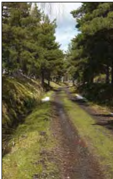
Dava Way near Bogeney