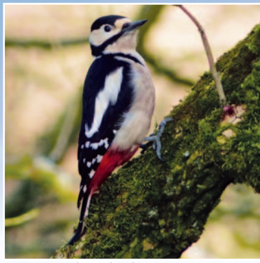
Great spotted woodpecker

Farmland crops offer easy pickings to many small birds and mammals, so they attract also their predators. including buzzards, sparrowhawks and owls, and also larger mammals such as hares and foxes.