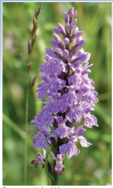
Common spotted orchid

If you are keen to spot wildlife, carry binoculars and walk alone or with walkers who share your interest and will keep quiet. Try to set off soon after sunrise, or go for a stroll in the evening, when animals are more active than in the daytime. Midges also prefer these times, so protect your skin, especially between May and September and in still weather.