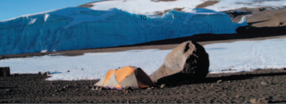
Lonely campsite in the Reusch Crater