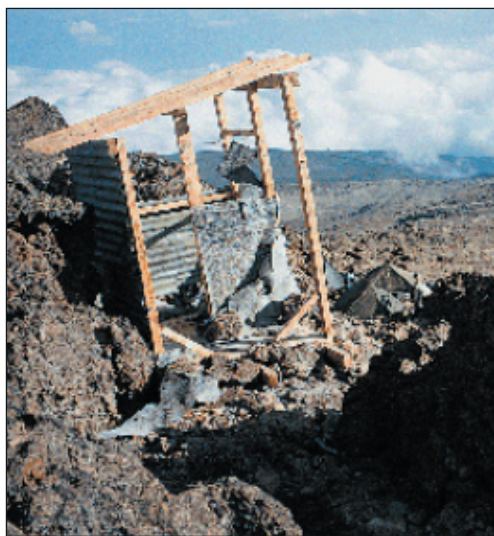
Latrine at Barafu Camp, Machame route

On Rongai, you use Marangu for descent, camping near the huts and making a complete traverse of the mountain. You also have the choice between direct and indirect alternative: see page 58. On Machame, you descend by a more direct route, normally via Mweka Camp. It's more strenuous than the other two, because