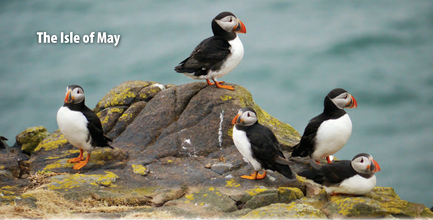
Puffins on the Isle of May

Known as the 'Jewel of the Forth', this island lies about 6 miles (10 km) south-east of Anstruther, and is rich in wildlife, scenery and history. Its ferry works from April to September inclusive. Because the harbour at Anstruther dries out, its departure time varies between 09.00 and 15.00, and on certain days there's no sailing. Check times and book online at www.isleofmayboattrips.co.uk .