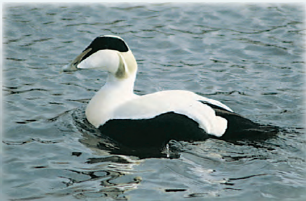
Eider duck (male)