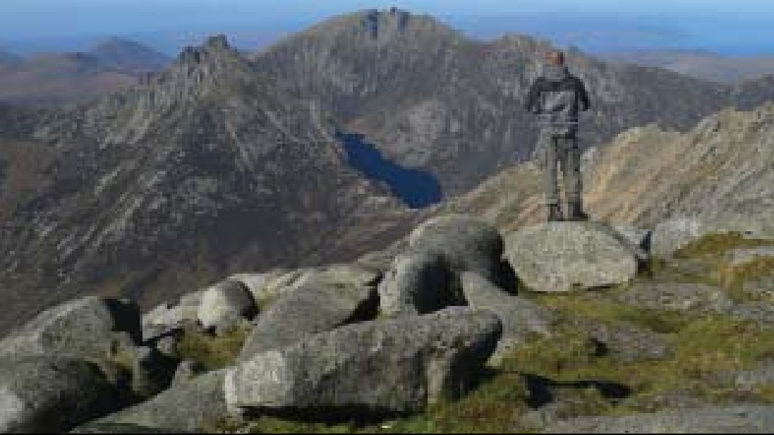
Looking northward from Goat Fell's summit