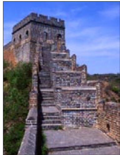
Barrier wall at Jinshanling