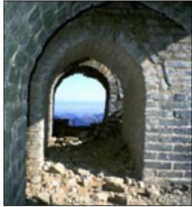
Inside a watch-tower, Mutianyu

An interesting variant is the 'barrier wall' – a succession of transverse protective barriers, carefully designed so that archers could fire down independently on the enemy. You may walk past a good example at Simatai: see page 51.