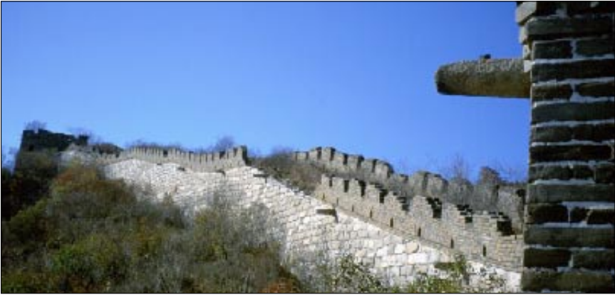
Stone drainage channels on watch-tower (foreground) and on the Wall at Mutianyu

Another Ming development was the 'mountain pass town': this was a garrison town in a strategic location where during an emergency generals could be stationed to direct operations. Such towns had strongly designed defensive structures, walls within walls and fortified gatehouses, and they were considered a key part of the Ming defences. There are fine examples at Jiayuguan (page 5), Shanhaiguan (pages 30-31) and Huangyguan (pages 42-45).