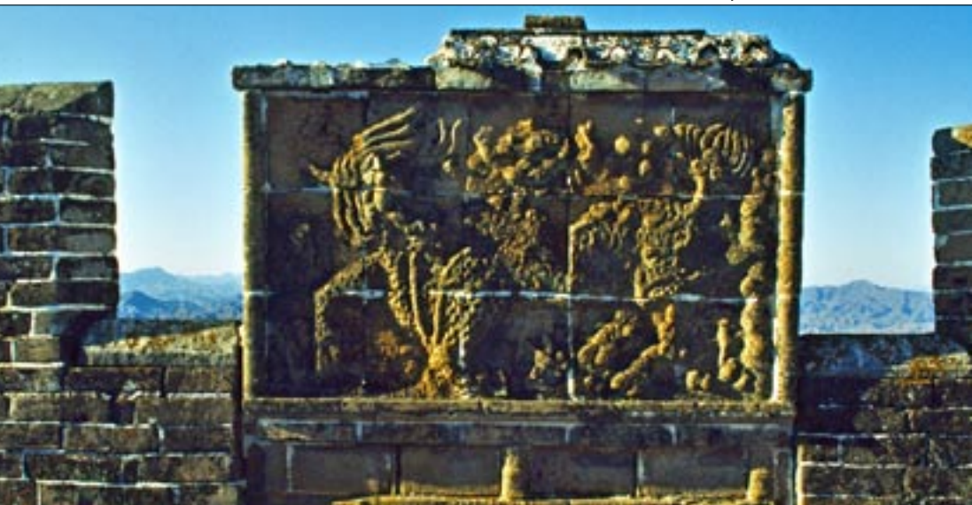
Panel carved in low relief on Kylin Tower, Simatai

The later constructions show great attention to practical detail, such as the handling of water drainage. The Wall, as well as its watch-towers, was given stone drainage channels at regular intervals. Pride in workmanship was shown in the bricks themselves: made locally, they often bore their maker's name and date of manufacture, although these are now mostly difficult to discern. Many sections and watch-towers had inlaid stone tablets with low relief. A beautifully carved example survives on Kylin Tower, Simatai.