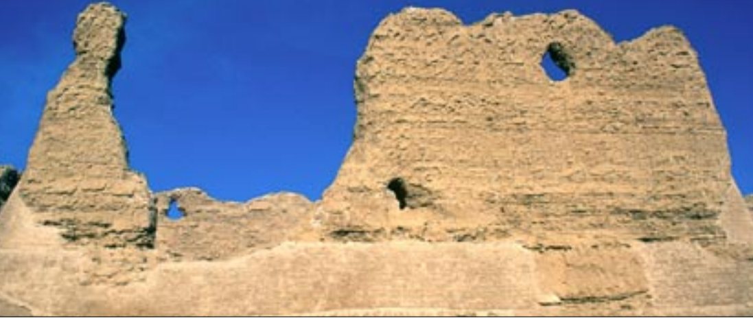
Hecang Fortress at Yumenguan, Gansu Province

Early methods of constructing walls were as varied as the materials to hand. Under the Western Han Dynasty, the ‘yellow earth’ of the Loess Plateau was tamped (heavily compressed) and shaped between wooden boards. In stony areas, stones were chosen by shape and built up into a dry-stone wall. In sandy desert areas, available plants (tamarisk twigs, jarrah or reeds) were intertwined and filled in with sand. These walls do not resemble the elaborate stone and mortared brickwork of the Ming Dynasty: the photographs above and on page 15 are more typical of long stretches of Qin- and Han-built walls further west.