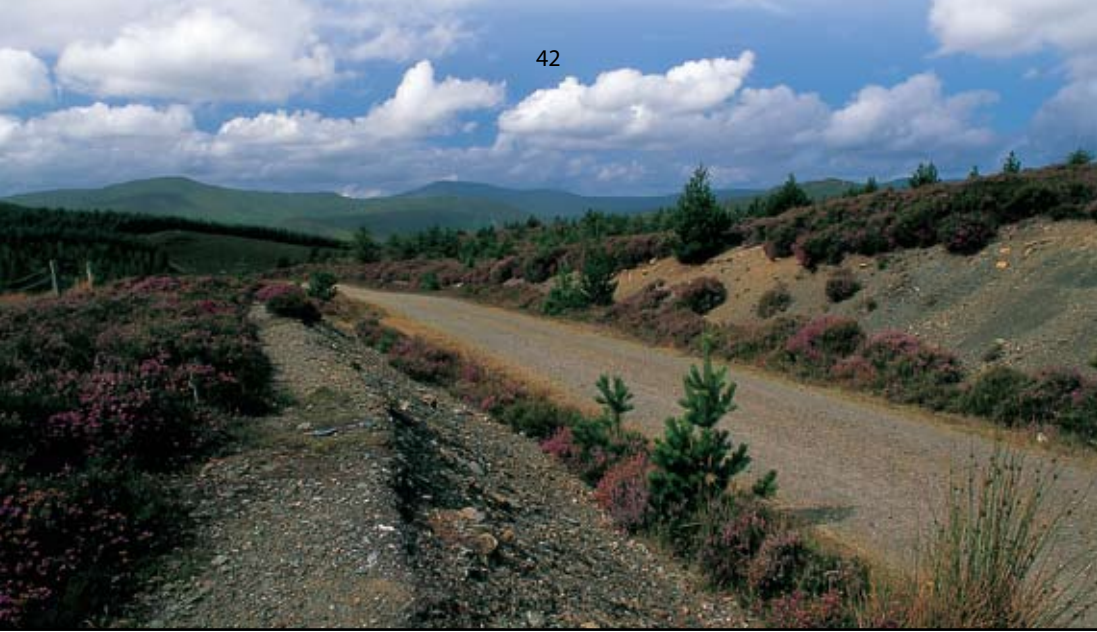
South-west toward Scarr and Tonelagee mountains