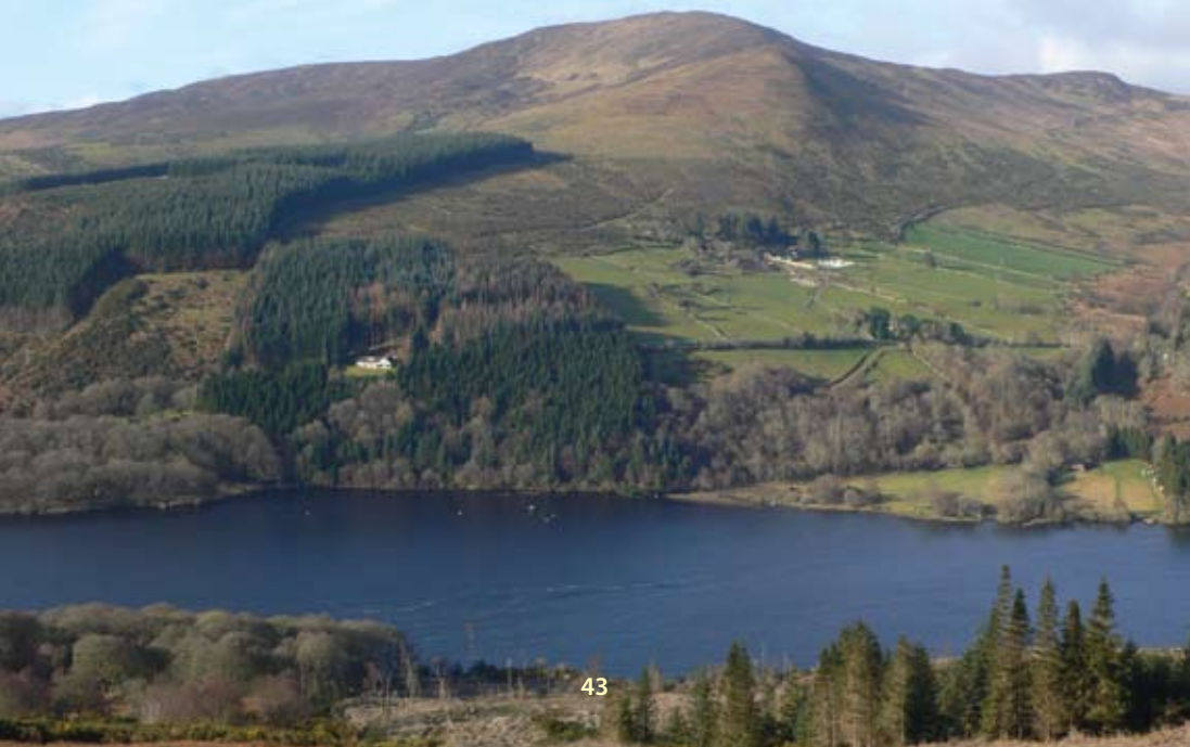
Across Lough Dan to Scarr mountain