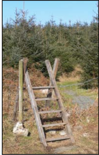
Stile at foot of narrow path