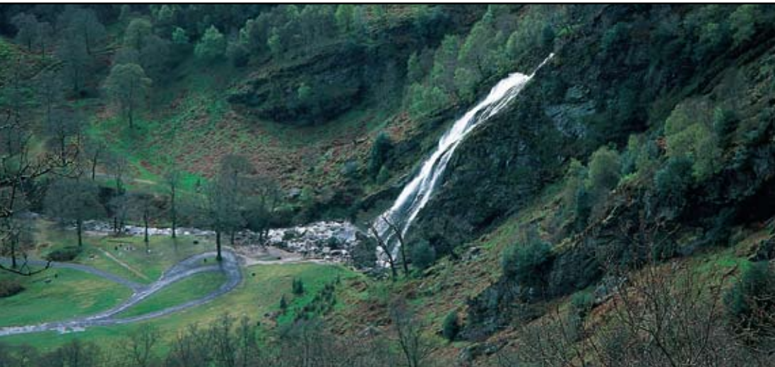
Powerscourt Waterfall, seen from the Way