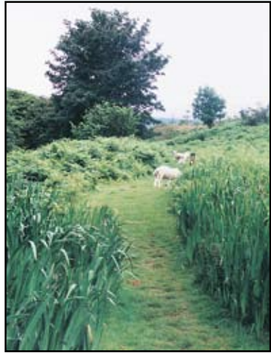
Beside Glenree River