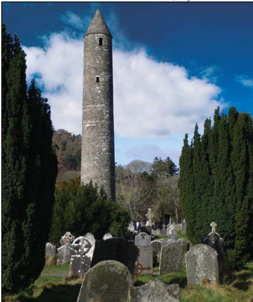
Round Tower, with gravestones

The Round Tower is surrounded by gravestones and dominates the scene. It stands some 30 metres high and is one of Ireland's finest. These tall tapering towers served both as a landmark for visitors and as a bell tower. Sometimes, especially when under attack from the Vikings, they also provided a secure place of refuge for people and valuables. Glendalough's round tower was divided internally into six storeys by timber floors. Once safely inside, the monks could pull up the access ladder. Its cap was rebuilt in 1876, using stones found inside.