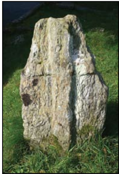
Monolith cross, Glendalough

Much later, in the mid-twelfth century, another saint, Laurence O'Toole, was Abbot of Glendalough. His buildings probably include St Saviour's Priory, with its romanesque windows and fine stone carvings of animals. Later, O'Toole became Archbishop of Dublin, and in 1226 he was canonised by the Pope.