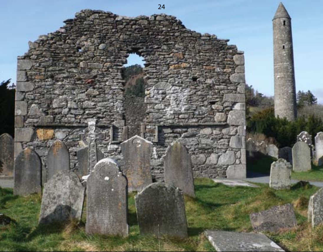
Cathedral, seen from the east

The largest ruin is the roofless cathedral, which dominates the centre of the main graveyard. Built in phases, its nave is the oldest part, the chancel dating from the late 12th century, with beautiful stone carvings. Its walls are lined with grave slabs for people who died during a period of a thousand years.