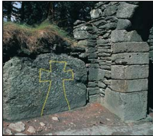
Entrance gateway, with cross highlighted

The entrance gateway is imposing, and this is Ireland's only surviving example of a gateway into a monastic enclosure. Originally it was two-storeyed, with fine granite arches and a timber roof. Embedded in the stone wall is a stone tablet engraved with a large cross. This marked the boundary of the area of refuge.