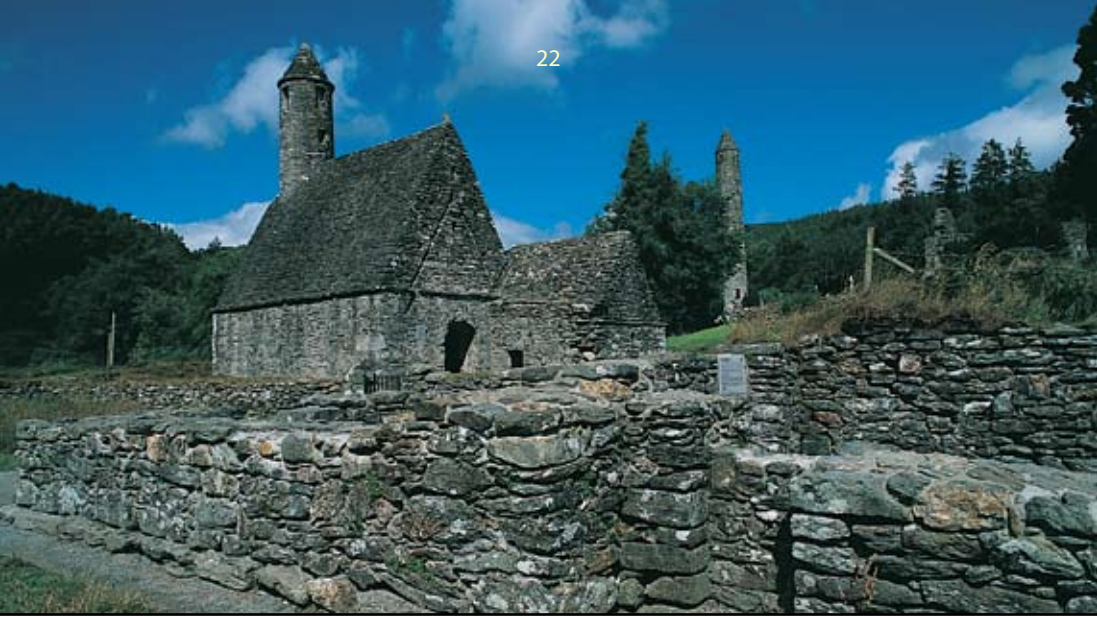
St Kevin's Church (or 'Kitchen')

St Kevin was a descendant of the royal house of Leinster who turned his back on privilege. His solitary life as a hermit in a cave at Glendalough inspired many disciples, and the monastery was founded after his death in AD 618. It developed into a centre of learning, eventually housing up to 200 monks, who worked at copying and illuminating holy manuscripts, and caring for the sick. St Kevin allegedly lived from 498-618 AD, but in those days to have lived to an age of 120 years would certainly have required divine intervention!