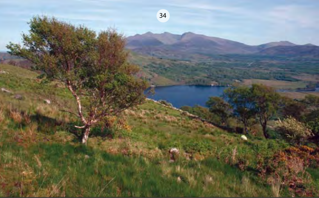
MacGillycuddy's Reeks and Lough Caragh from Seefin