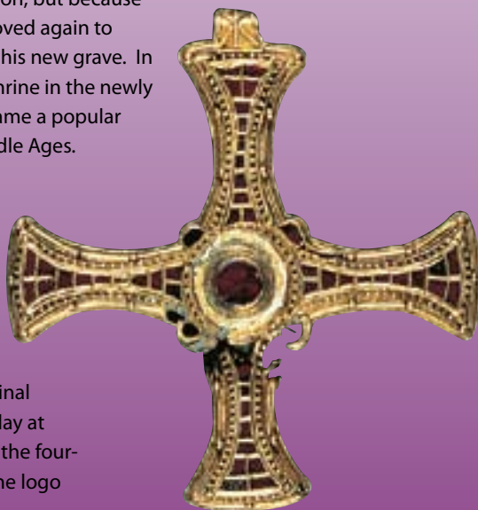
The Cuthbert Cross, Durham Cathedral

During the Reformation, Cuthbert's shrine was dismantled but the monks managed to hide his remains. In 1827 Cuthbert's coffin, still containing his bones, was dug up and opened. Around his neck was his beautiful pectoral (chest-worn) cross, made of gold and studded with garnets. His original (AD698) coffin and this cross are on display at Durham Cathedral. A stylised version of the four-armed Cuthbert Cross is used today as the logo of St Cuthbert's Way.