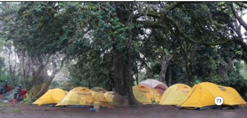
Big Tree Camp

The trail winds up through luxuriant rain forest, with huge trees bedecked with bearded lichen. The trail has lots of tree roots and may be slick with mud. There are steep undulations, especially at first, but the gradient slackens after a while. The sight of monkeys (blue and colobus), sounds of birds and profusion of wild flowers makes for plenty of interest. After a couple of hours, you reach Big Tree Camp ( Mti Mkubwa ). The Park authorities call it Forest Camp, but everybody else uses the obvious name.