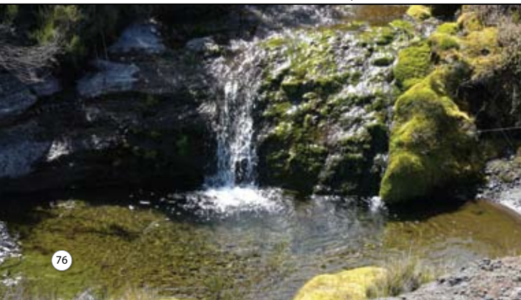
Rock pool near Simba Cave

The hike features gentle ascent across the plateau, with the attraction of constant views of Kibo and its glaciers if the weather is clear. After 4km, the 4x4 track from Londorossi Gate (used mainly for emergency evacuation) joins from the left. You'll soon see Simba Cave picnic site ( simba means lion) with an attractive pool nearby.