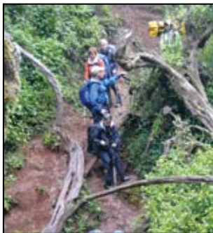
Steep terrain with tree roots

From the Gate, the rough 4x4 track heads south to Lemoshu Glades. In wet conditions this journey can be tough for both driver and passengers. By the time that the porters' loads have been divided and the guides are ready for you set off, it may be late afternoon before you leave the trailhead at 2350m. Carry plenty of water and your head torch in case of arrival after dark.