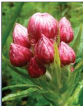
Helichrysum in bud, above Big Tree Camp

Impressive though the Shira peaks may look, they don't compare with the awesome massif of Kibo, distant in the south-east. Depending on your state of mind, you may find this glimpse of the task ahead inspiring or daunting. From the ridge, there's a short, pleasant descent to Shira 1 by a path through the boulders and masses more Helichrysum .