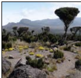
Near Fischer Camp

The next day's destination is Barranco (3950m) with negligible altitude gain (perhaps even loss) – great for acclimatisation. The trails from the three campsites head south or south-east, and converge at about 4300m. Shortly you pass the grave of a Canadian hiker who was taken ill with AMS at Barranco and died before he could be evacuated. This is a sobering reminder of the importance of taking care – both of yourself and of other team members.