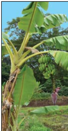
Banana palm in flower

You may see monkeys on the lower slopes, though they are commoner higher up, in the forest: 'blue monkeys' and colobus: see p87.