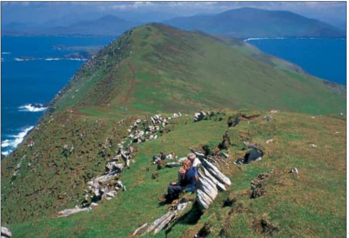
Picnic at the Cró, summit of Great Blasket

Thomson, George (1987) Island Home: the Blasket Heritage Mount Eagle Publications 0-86322-161-0