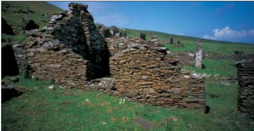
Ruined house in the upper village

Even in the 20th century, island life had a distinctive, medieval flavour: arranged marriages, no machinery or electricity, and a cashless, co-operative economy. The abandoned village and outlying buildings add a fascinating human dimension to a walk (described below) that is already rich in mountain views, seascapes and wildlife. If you are lucky enough to enjoy a fine day on Great Blasket, this could be the highlight of your visit to Dingle.