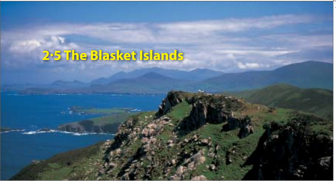
View north-west towards Brandon Mountain from Great Blasket

The Blaskets lie on the westernmost edge of Europe. They were inhabited for many centuries, probably since the Iron Age. Great Blasket, by far the largest of the six, had a population of some 160 people during World War I, but this soon dwindled and the island was finally abandoned in 1953.